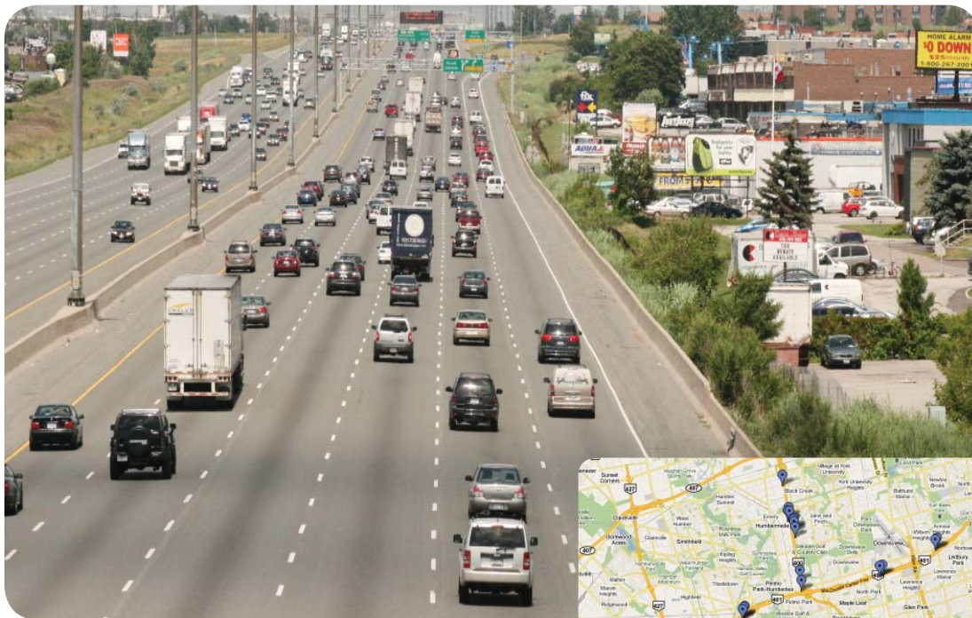
Highway 400 - Northbound