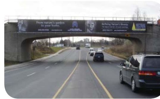
Jane Street - North Facing - Half or Full Bridge

A great NEW way to advertise in Vaughan!