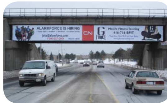
Pine Valley Drive - North Facing _ Half or Full Bridge