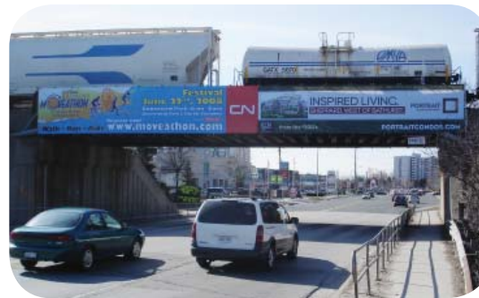
Bathurst Street - North Facing _ Half or Full Bridge