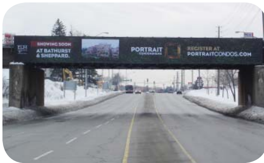
Dufferin Street - North Facing _ Half or Full Bridge