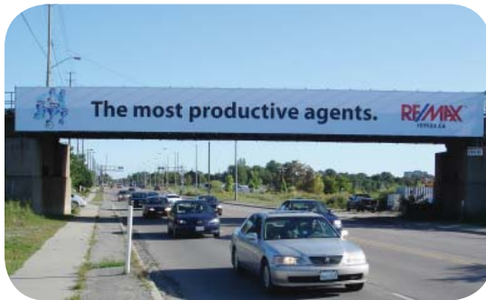
Islington Avenue - North Facing _ Half or Full Bridge

8' x 38' Half Bridge. Contact our head office for full production details.